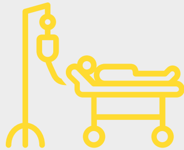
CRITICAL ILLNESS INSURANCE

Also available. Please contact your HR Representative for Details